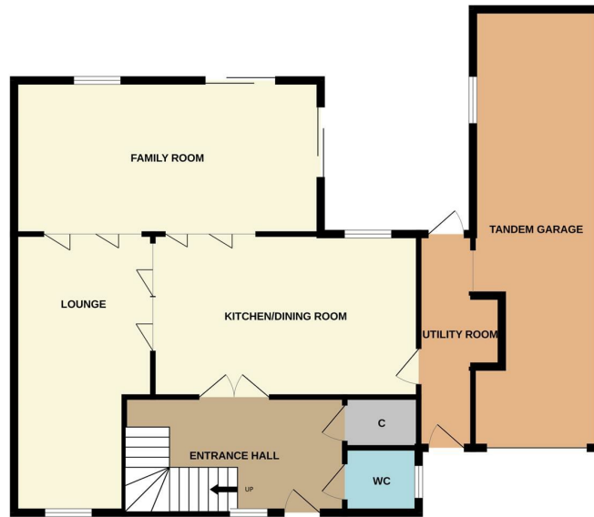
GROUND FLOOR 1146 sq.ft. (106.4 sq.m.) approx.